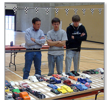
Derby racecar designs displayed.