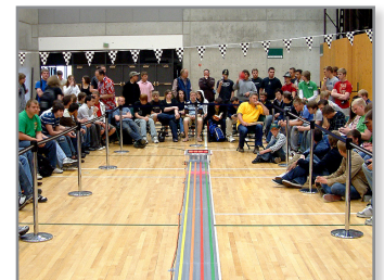
Students gather for the big race.