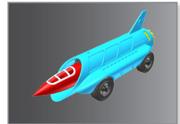
CAD rendering of a student's racecar design.

Oh, and the prizes? They are trophies printed using the Dimension 3D Printer. "The 3D Design Derby allows high school students from around the state to engage with UVU in learning and applying engineering, design, 3D modeling and prototyping skills in a fun and competitive setting," says Manning. "The interaction among students and the confidence they gain in their skills help promote engineering as an exciting and viable degree option for these kids. And frankly, none of that would be possible without the cars produced through the Dimension 3D Printer."