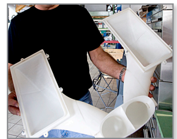
Prototype airbox printed in ABS.