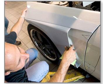
Front fender piece being attached to the body.