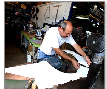
Assembling the fender flare.

For more information about Dimension 3D Printers, call 888.480.3548 or visit www.dimensionprinting.com