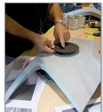
Gas cap inserted into printed rear fender section.