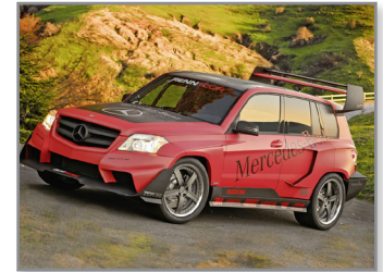
RENNtech GLK350 SPEC.R HYBRID

Hanna put the 3D printer to use for the GLK Challenge, producing prototypes to test multiple variations, review fitment, and prototype difficult-to-machine components, such as undercuts. “We had one month to produce the GLK. Without the Dimension 3D