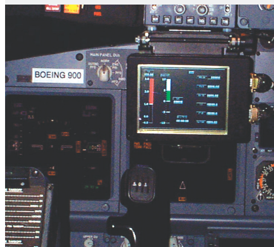
One of five quickly produced visualization models for a flatpanel LCD cockpit display in Boeing's 737 (900).