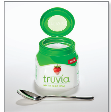
The Truvia package was designed to be attractive enough that consumers would want to display it on their countertop.