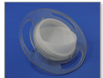
The Gyro Bowl prototype ready for the final step.