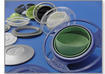
A series of Dimension-printed Gyro Bowls ready for market.

Before the Dimension printer, Kovacevich found the ability to quickly test ideas with minimal setup to be problematic. "We sent 100% of the parts to outside bureaus but explored alternative options when we realized what a day is worth in cost," says Kovacevich. "Now, we can justify running parts several times a week. And it's also a sales tool. We give several tours a day through our offices and the 3D printer is often a favorite stop for potential clients."