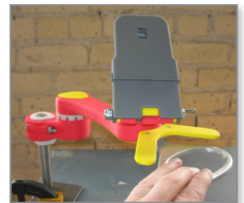
Designers quickly move from idea to concept with a functional prototype.