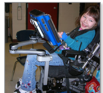
The Mount'n Mover puts trays, laptops, and other devices within reach.