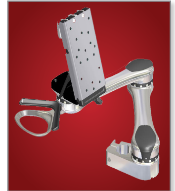
A dual arm version of Mount'n Mover is comprised of 125 parts - 60 of which are custom.

Goodwin also makes a cost comparison to smaller components of the movable-arm prototype production. For the 36 locking mechanisms each assembly required, an outside